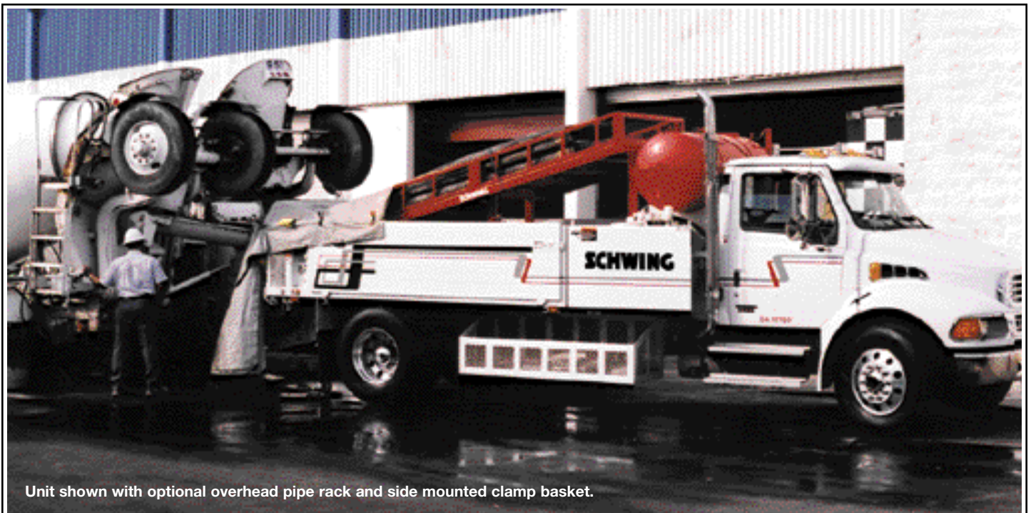
Unit shown with optional overhead pipe rack and side mounted clamp basket.